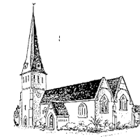
St Mary's, Apsley