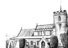
All Saints, Kings Langley