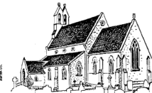
Holy Trinity, Leverstock Green