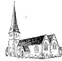
St Mary's, Apsley