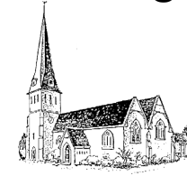
St Mary's, Apsley