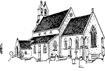
Holy Trinity, Leverstock Green