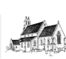
Holy Trinity, Leverstock Green