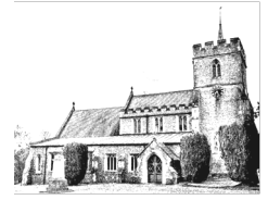
All Saints, Kings Langley