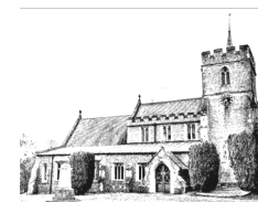
All Saints, Kings Langley