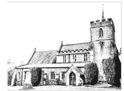
All Saints, Kings Langley