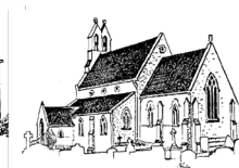
Holy Trinity, Leverstock Green