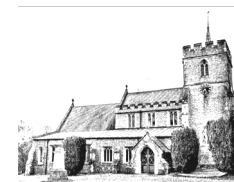
All Saints, Kings Langley