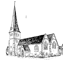
St Mary's, Apsley