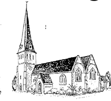
St Mary's, Apsley