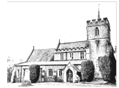
All Saints, Kings Langley