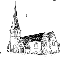
St Mary's, Apsley