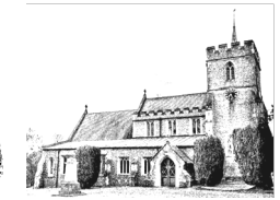
All Saints, Kings Langley