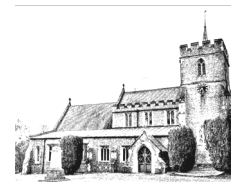
All Saints, Kings Langley