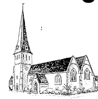
St Mary's, Apsley