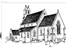
Holy Trinity, Leverstock Green