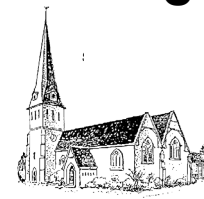
St Mary's, Apsley