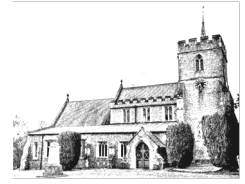
All Saints, Kings Langley