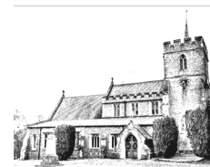
All Saints, Kings Langley