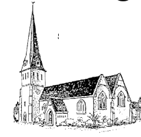
St Mary's, Apsley