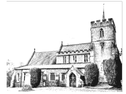
All Saints, Kings Langley