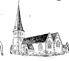
St Mary's, Apsley