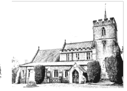
All Saints, Kings Langley