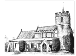
All Saints, Kings Langley