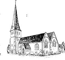
St Mary's, Apsley