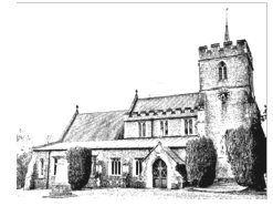
All Saints, Kings Langley