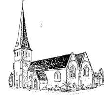
St Mary's, Apsley