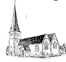
St Mary's, Apsley