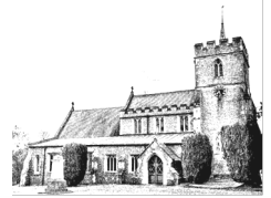
All Saints, Kings Langley