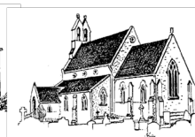
Holy Trinity, Leverstock Green