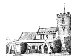
All Saints, Kings Langley