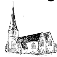
St Mary's, Apsley