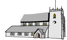
All Saints, Kings Langley