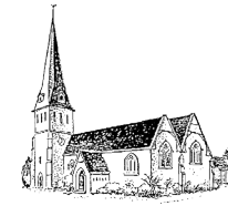
St Mary's, Apsley