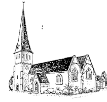
St Mary's, Apsley