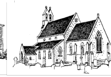
Holy Trinity, Leverstock Green