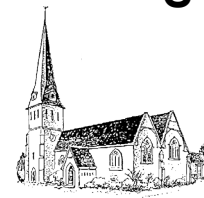
St Mary's, Apsley