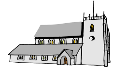
All Saints, Kings Langley