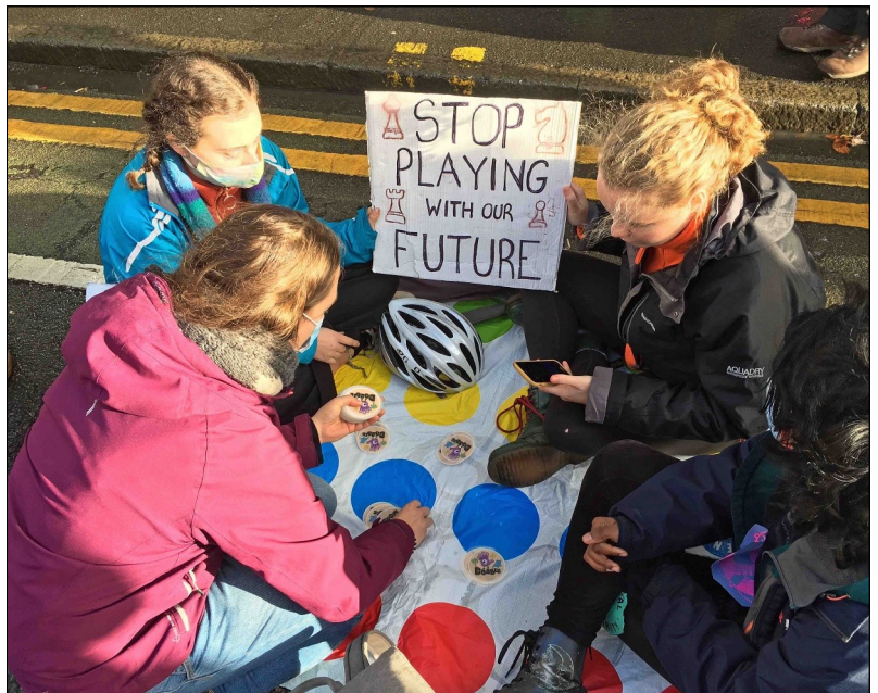
These young people came up with a fun and creative way to get their message heard.

The more voices heard in the UK holding the Government to account the more likely we'll see positive action. Let's ensure that the CofE is one of those voices!