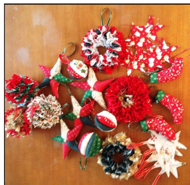
Home-made fabric Christmas tree decorations made 2016 and still going strong!