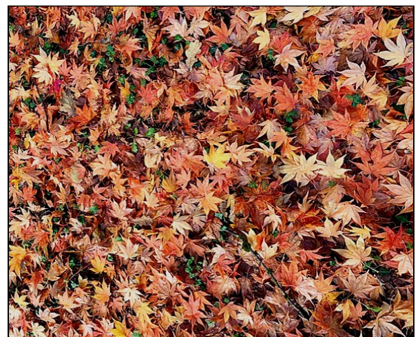
Westonbirt Arboretum