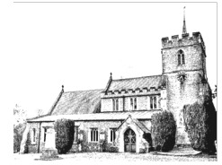
All Saints, Kings Langley