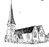
St Mary's, Apsley