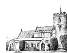
All Saints, Kings Langley