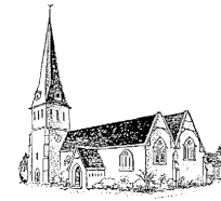
St Mary's, Apsley