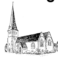
St Mary's, Apsley