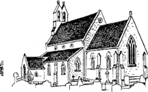
Holy Trinity, Leverstock Green