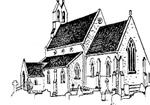
Holy Trinity, Leverstock Green